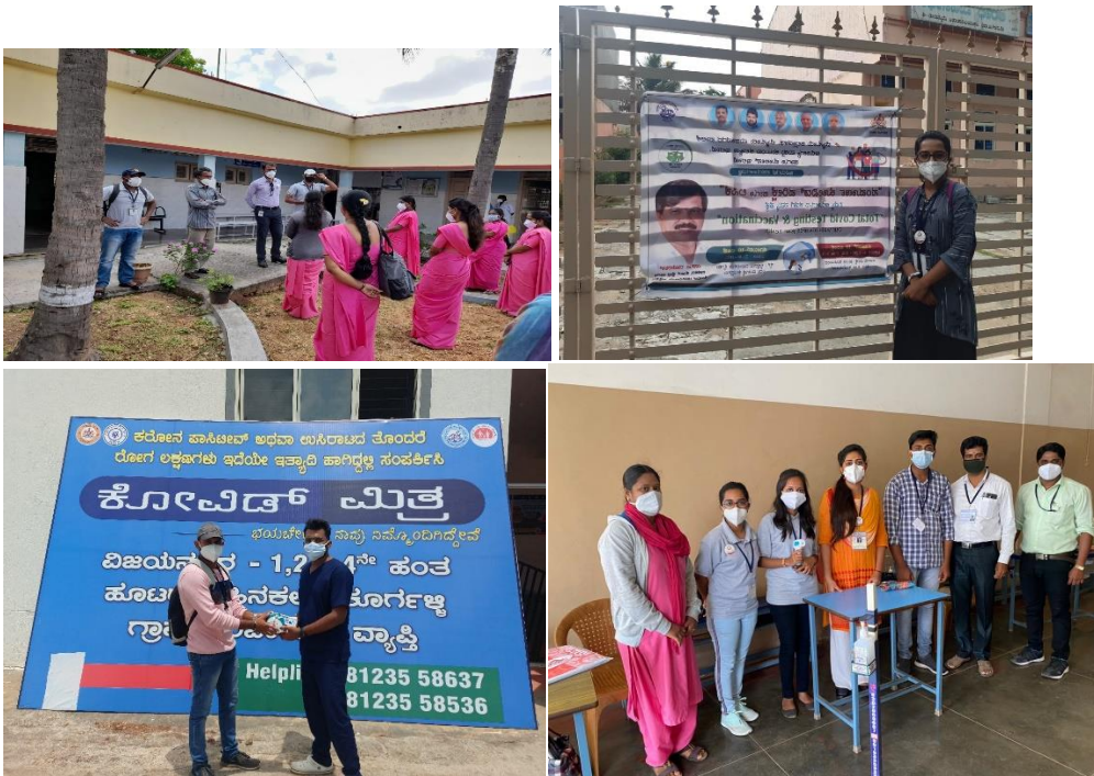
Some of the screen shots of the covid warriors and their involvement at various locations